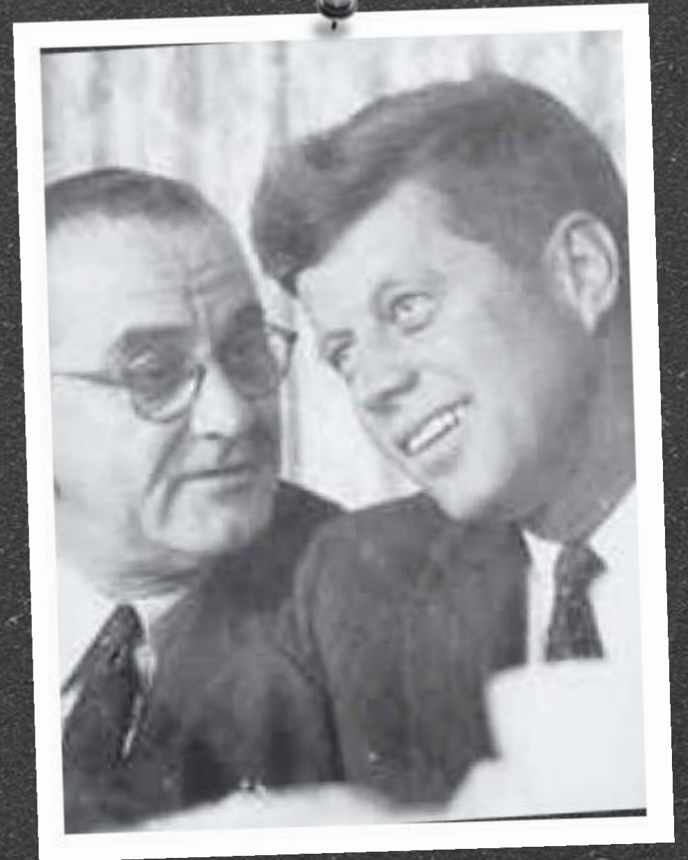
L.B. Johnson & J.F. Kennedy