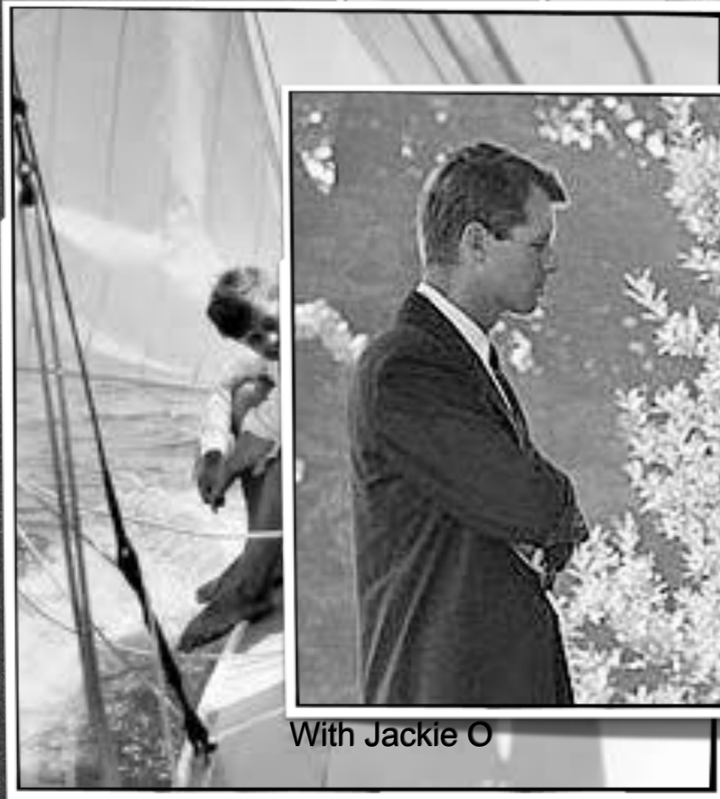
With Jackie O