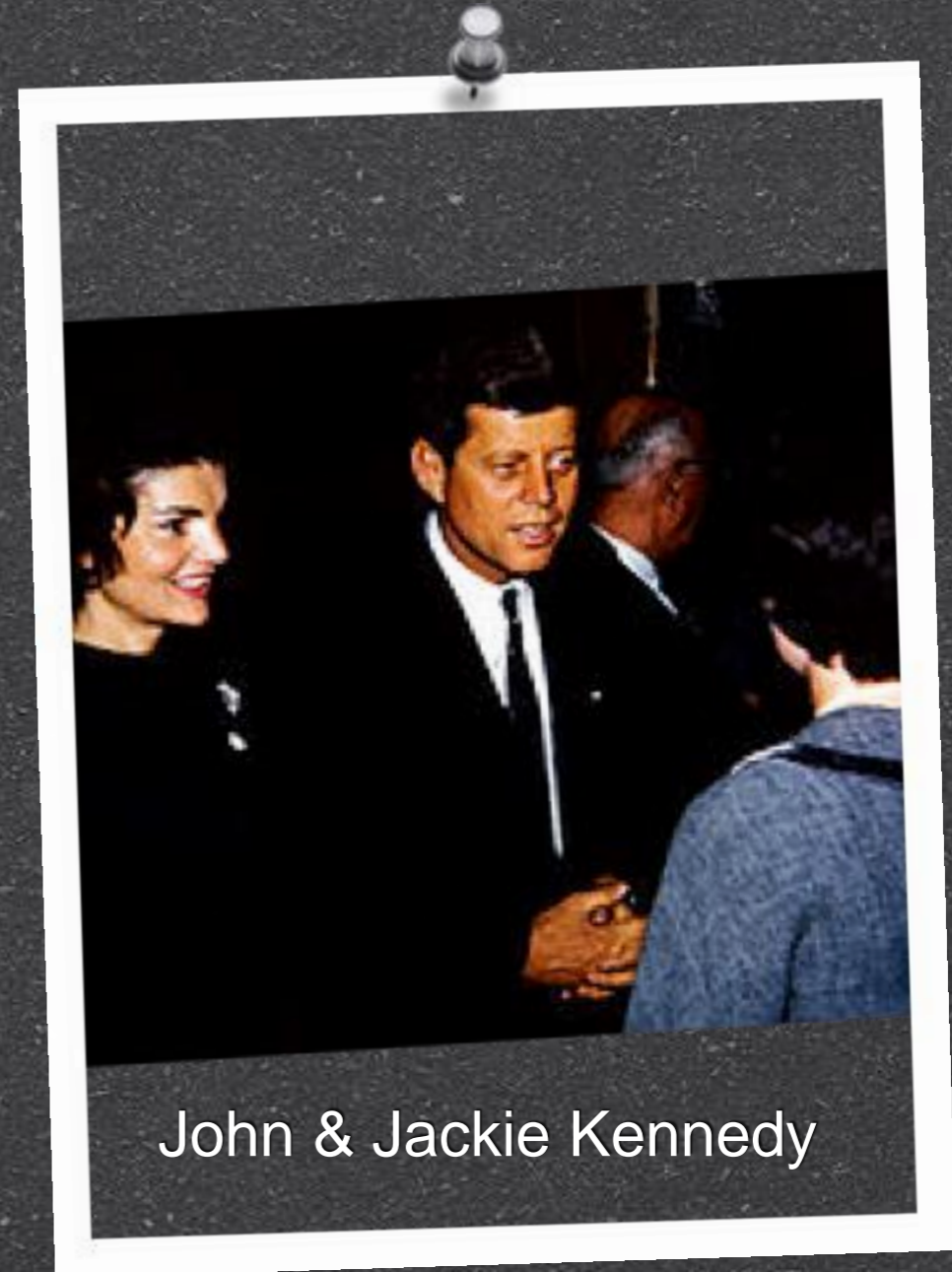
John & Jackie Kennedy